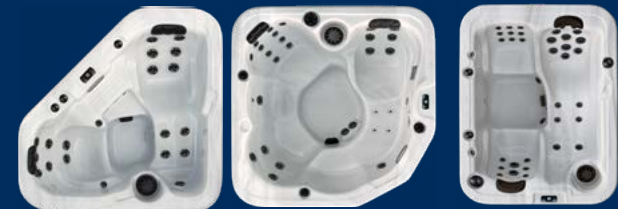
Bimini Treasure Cay Sunset Cove