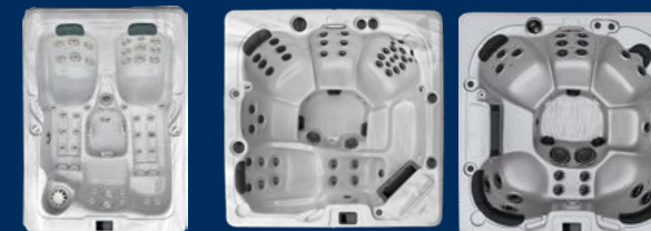
Twin Palms Nassau Royale