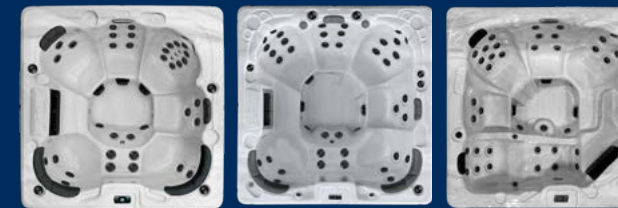
Tranquility Harbor Ocean Breeze Cabana Bay