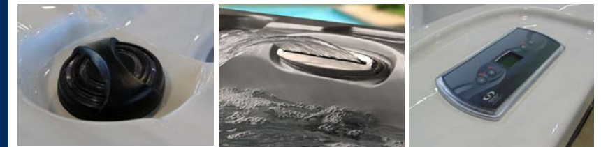
Adjustable Water Diverters Cascading Waterfall Illuminated Topside (K506 Standard)