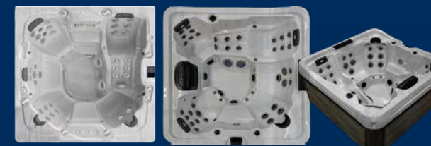
Paradise Bay 30th Anniversary