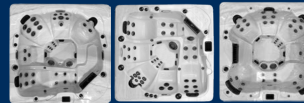
Coconut Bay Pleasure Cove Palm Island