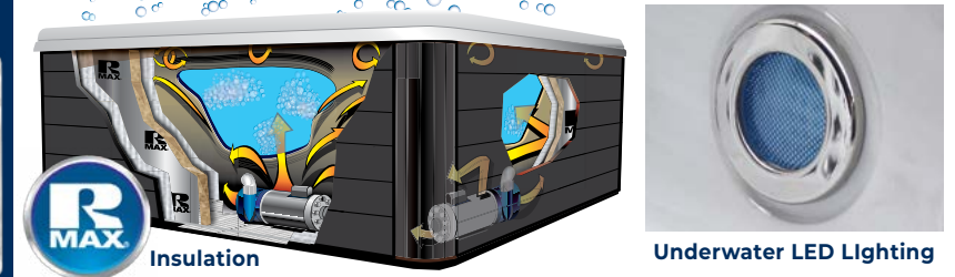
Insulation Underwater LED Lighting