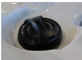
Adjustable Water Diverters