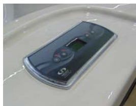
Illuminated Topside (K362 Standard)