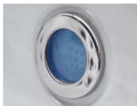
Underwater LED Lighting