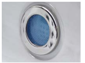
Underwater LED Lighting